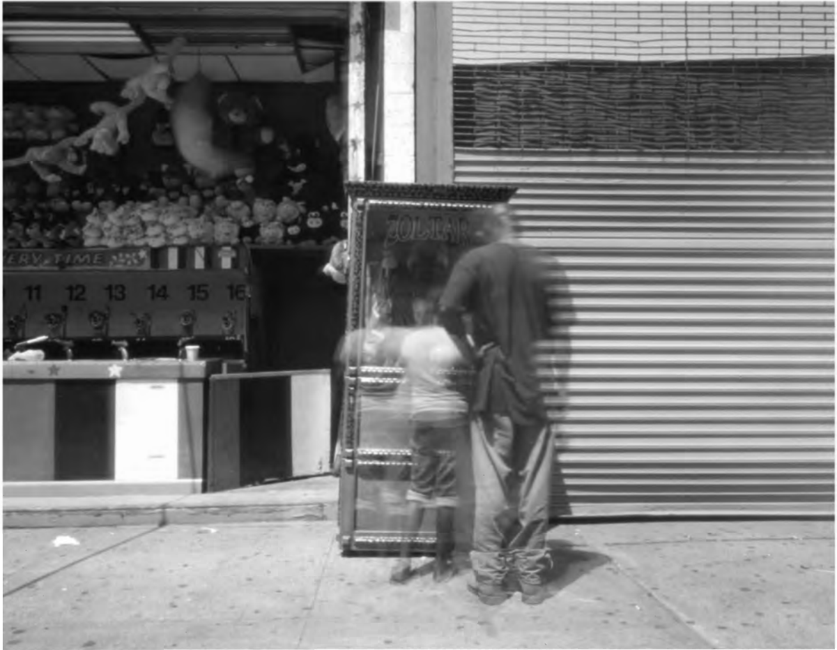
Zoltar Fortune Teller, a Coney Island version of the one in the movie BIG