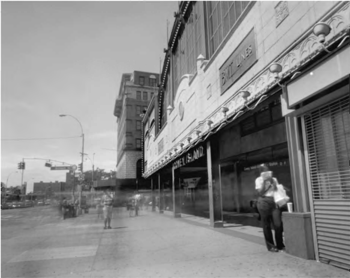
Coney Island BMT Subway Station