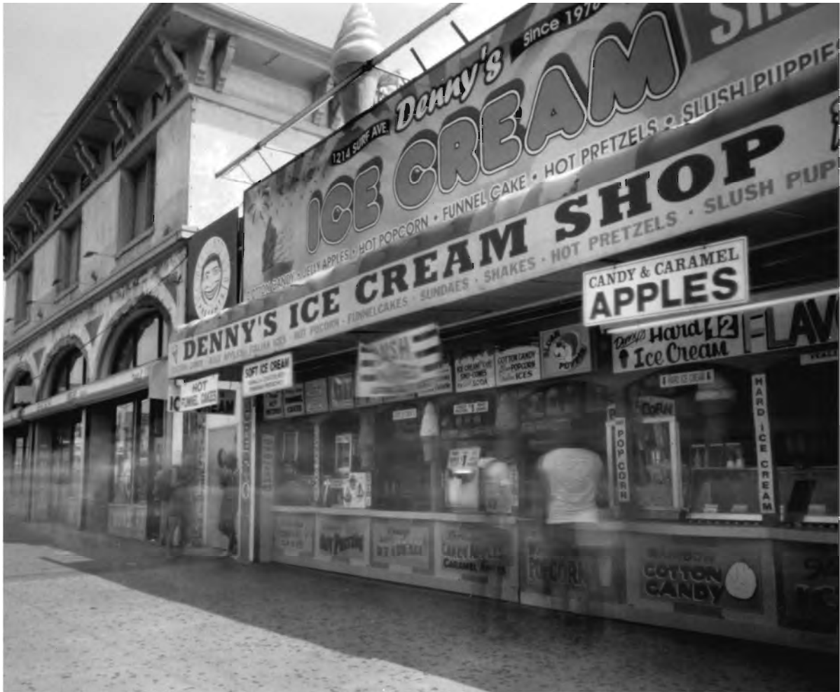
Denny's Ice Cream. Last season 2012