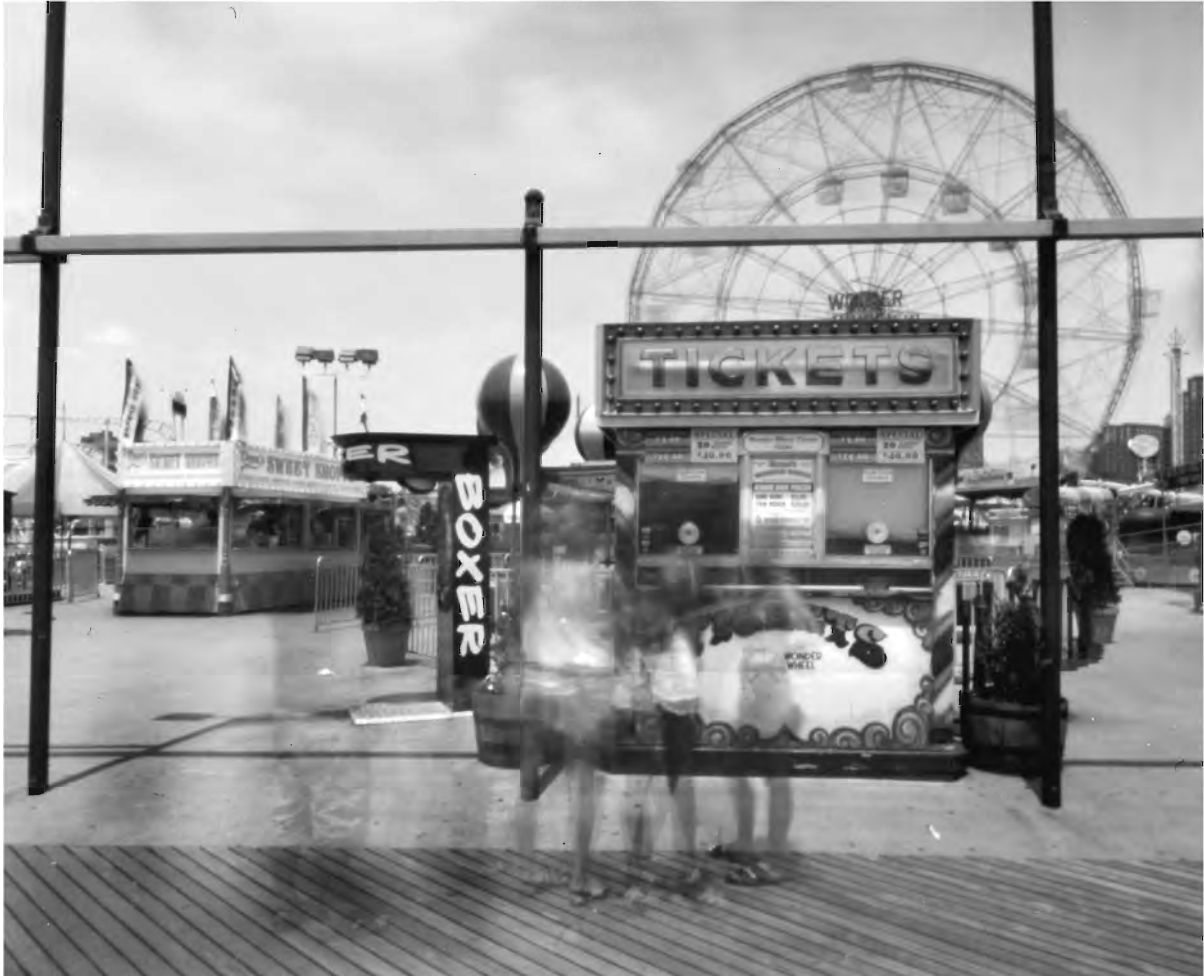
Getting tickets for Deno's Wonder Wheel and Amusement Park