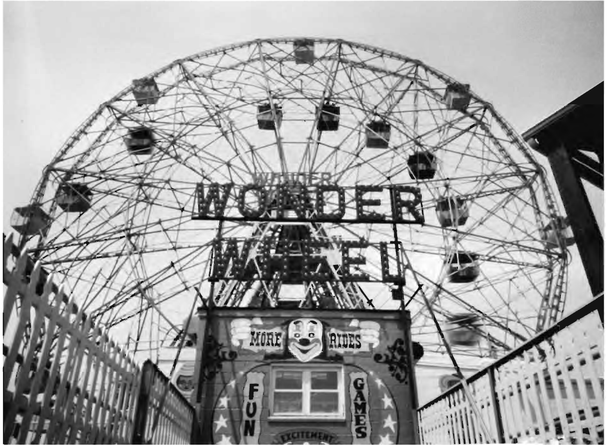
Coney Island's Wonder Wheel