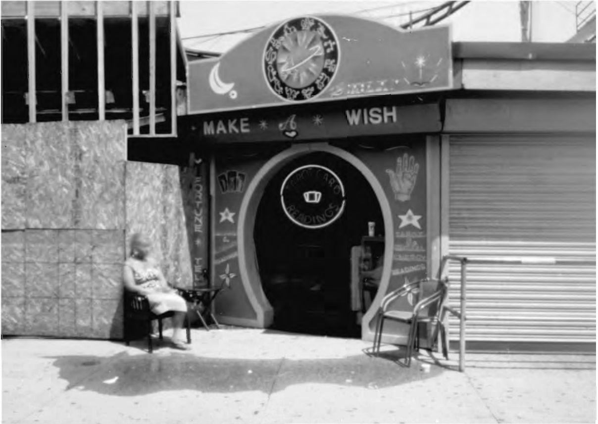
“Make a Wish”