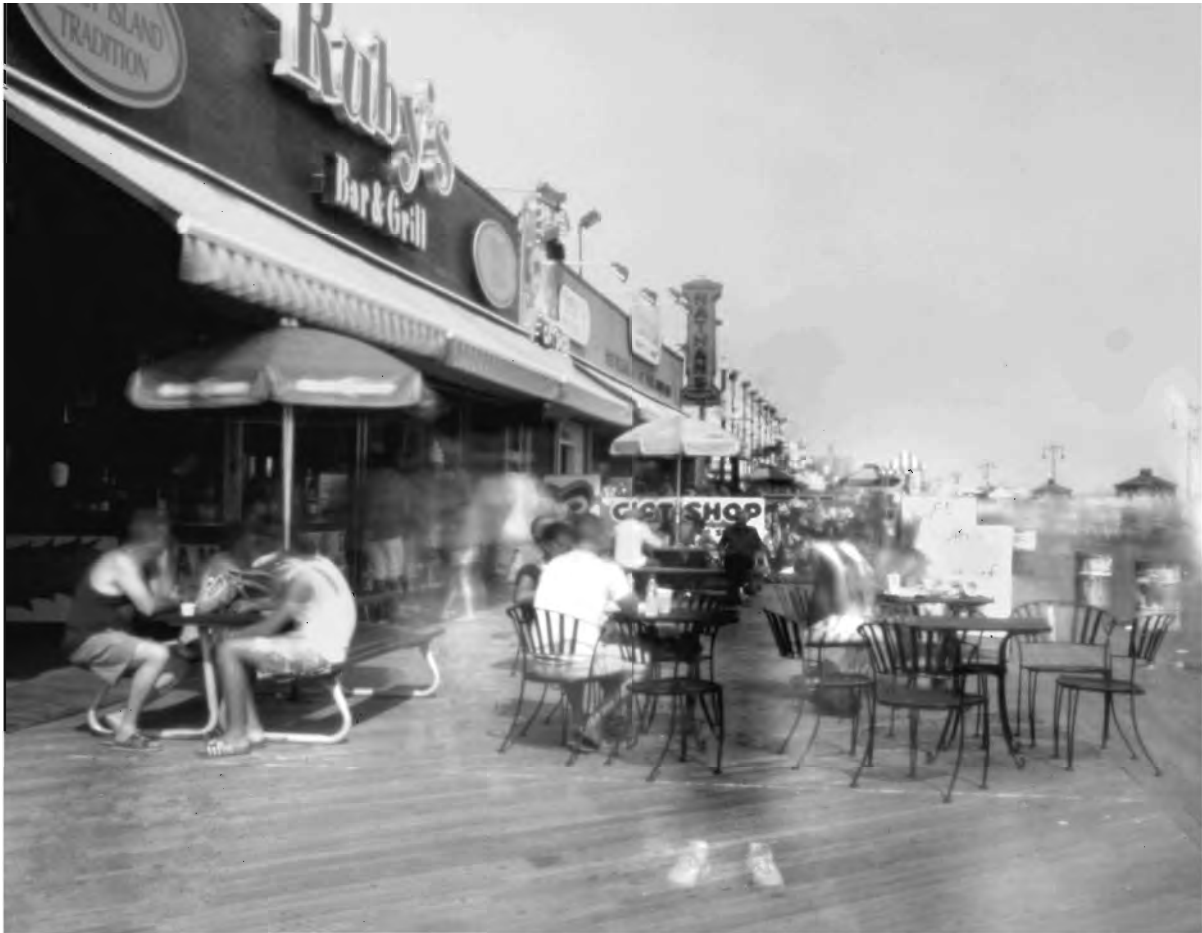
Ruby's Bar and Grill. "A Coney Island Tradition Since 1934"