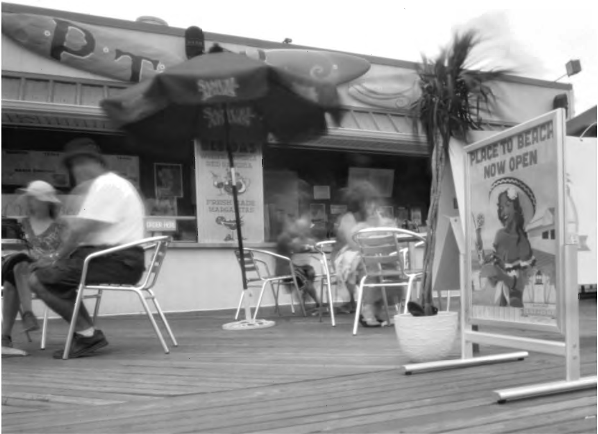
Place to Beach Bar on the Boardwalk