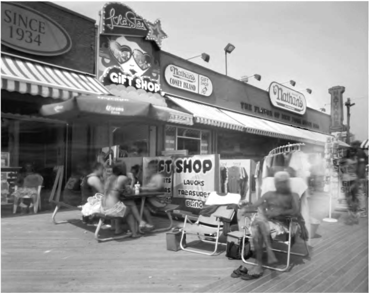
Summer sunning at Lola Star's Gift Shop on the Boardwalk