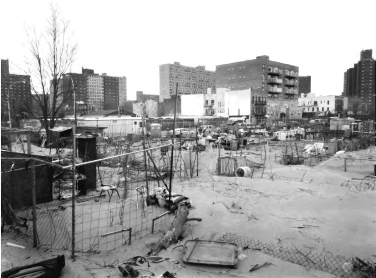
Sand deposited in the Coney Island community by Hurricane Sandy