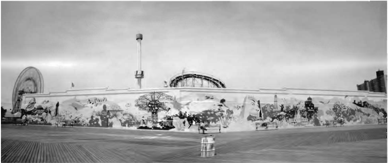
Boardwalk Mural at the New York Aquarium