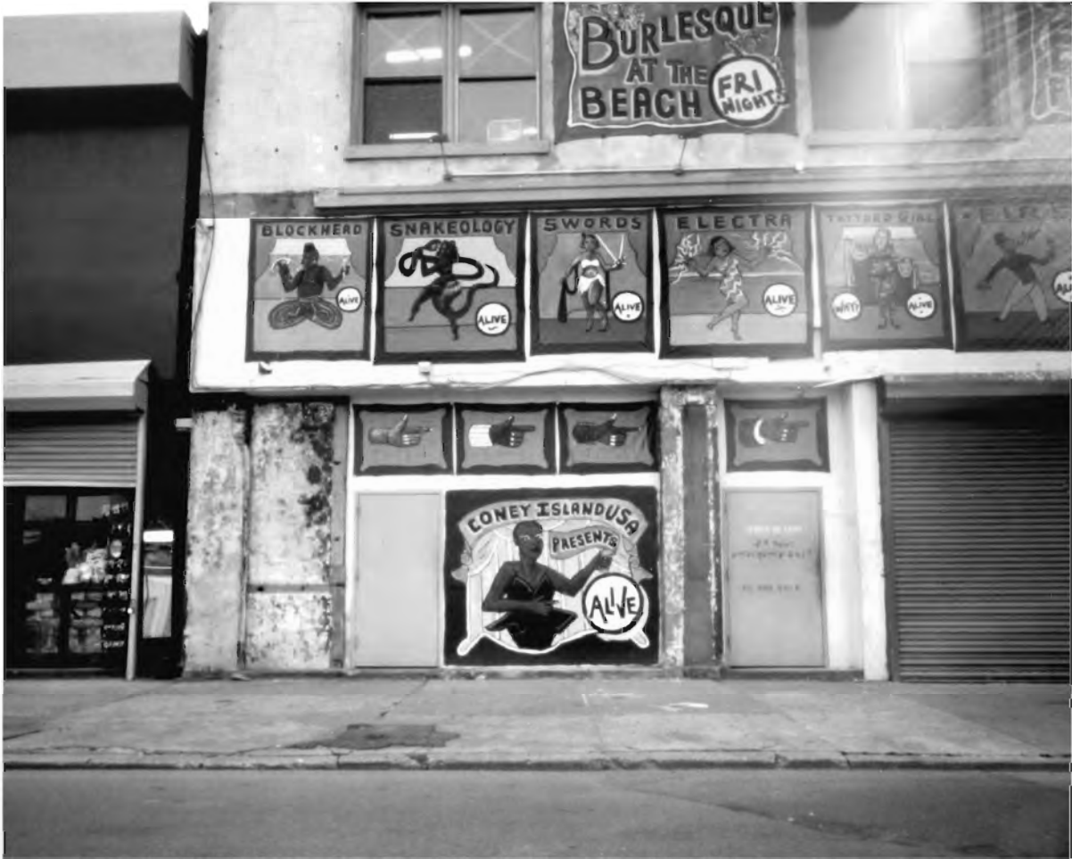
Coney Island USA