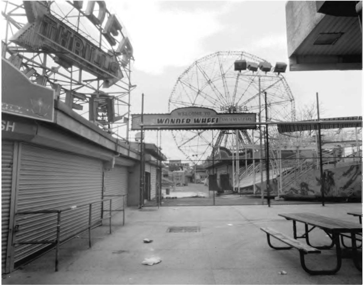
The Winter after Hurricane Sandy