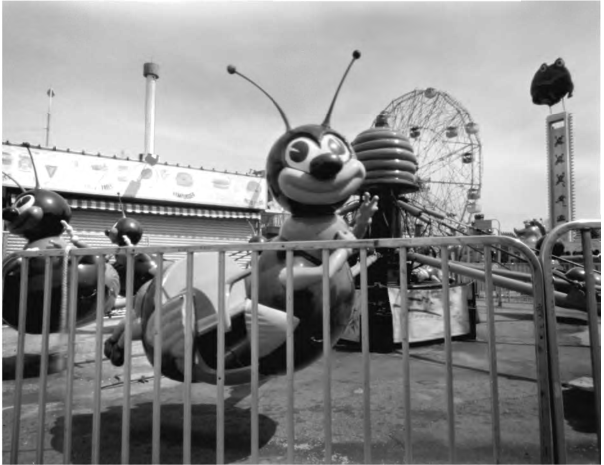
Kiddie rides. Removed 2012