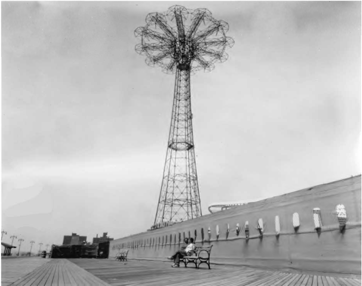
The Parachute Jump. Relocated from the 1939 New York World's Fair