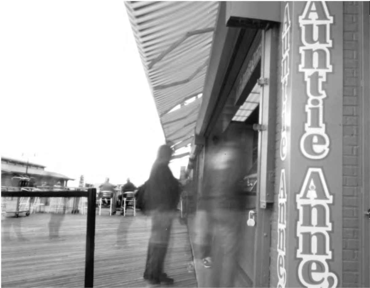
Auntie Anne's Pretzels on the Boardwalk