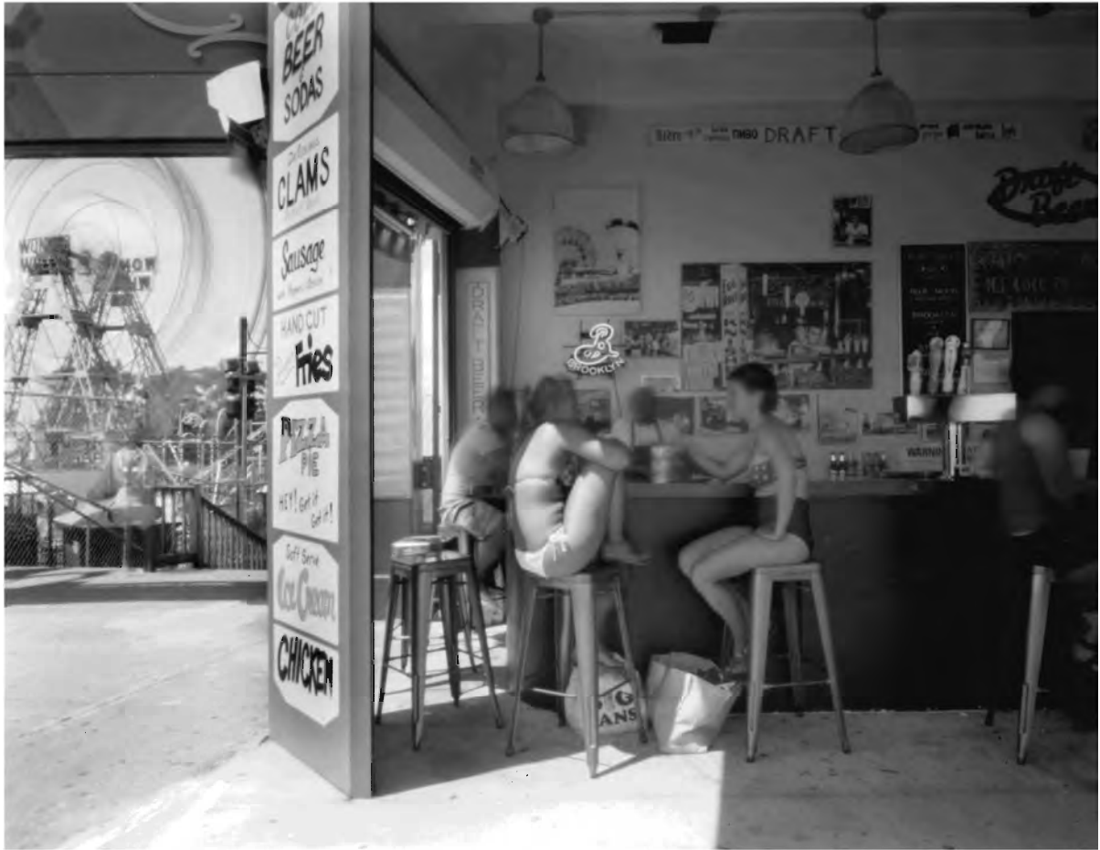
Paul's Daughter bar on the Boardwalk