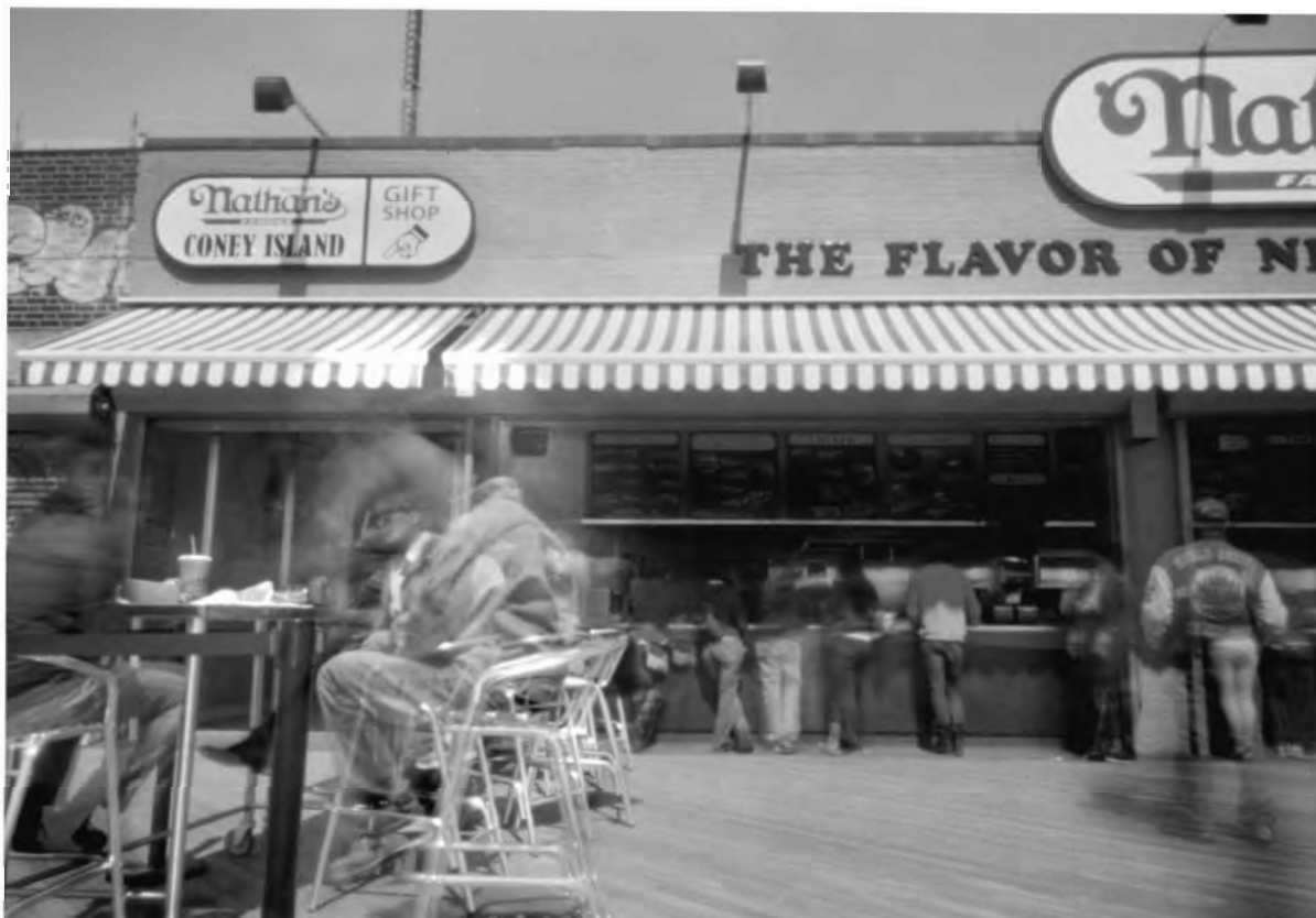
Nathan's Famous on the Boardwalk