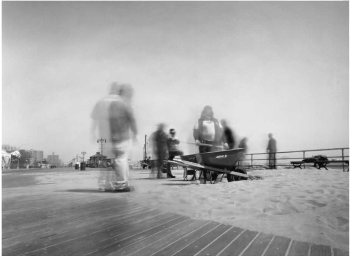
Cleaning-up the Boardwalk the Winter after Hurricane Sandy