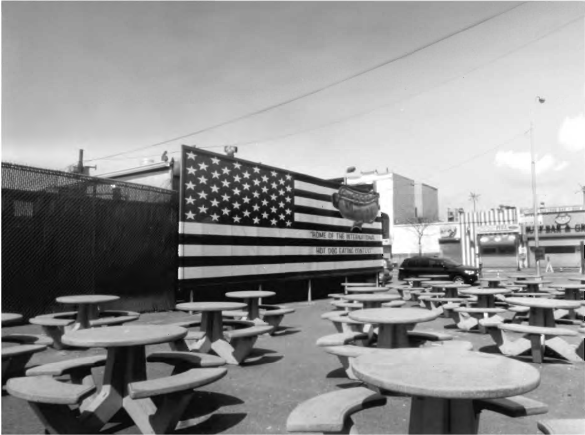
Nathan's Famous waiting for customers during restoration after Hurricane Sandy