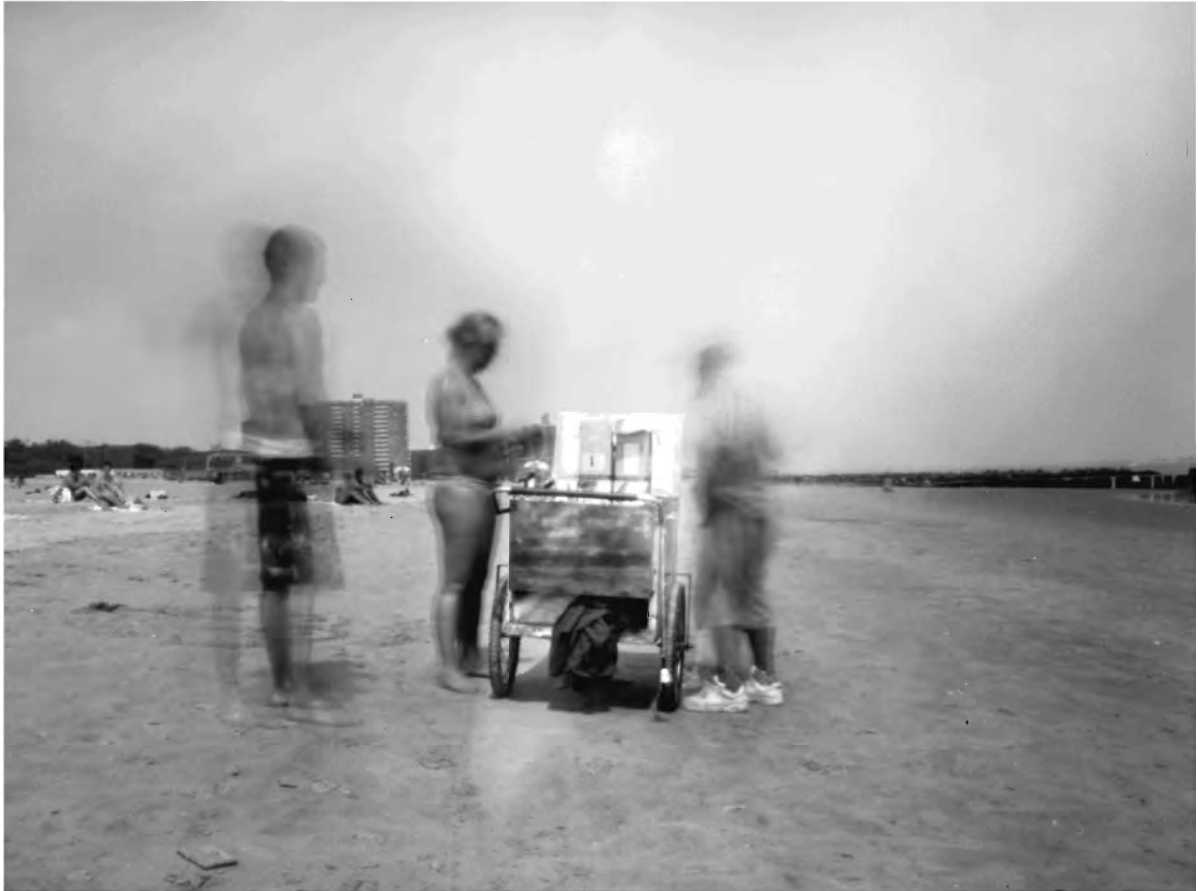
Selling ices on the Beach