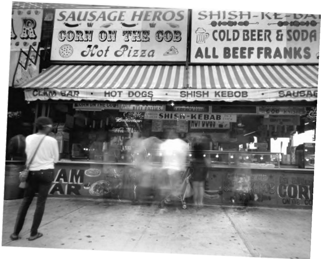
Pete's Clam Stop