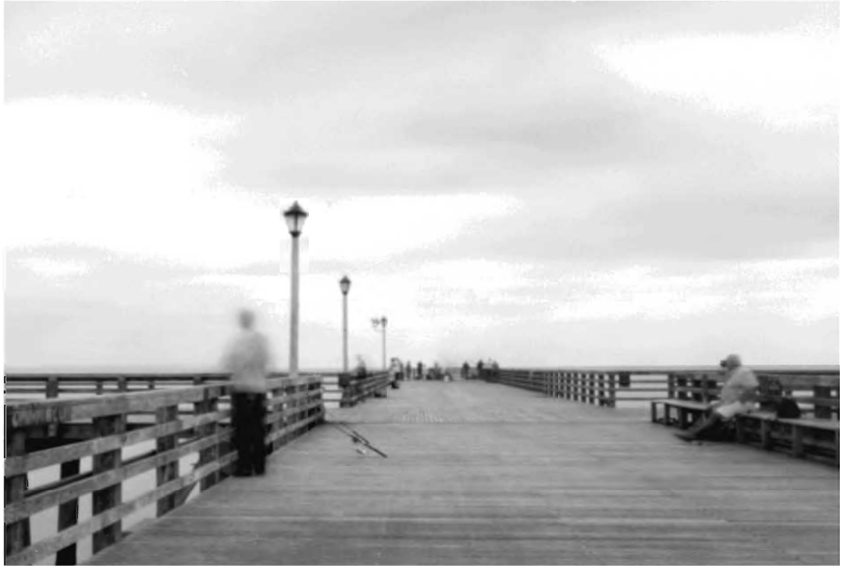
The Pier before Hurricane Sandy. It was destroyed by the storm. Rebuilt 2013.