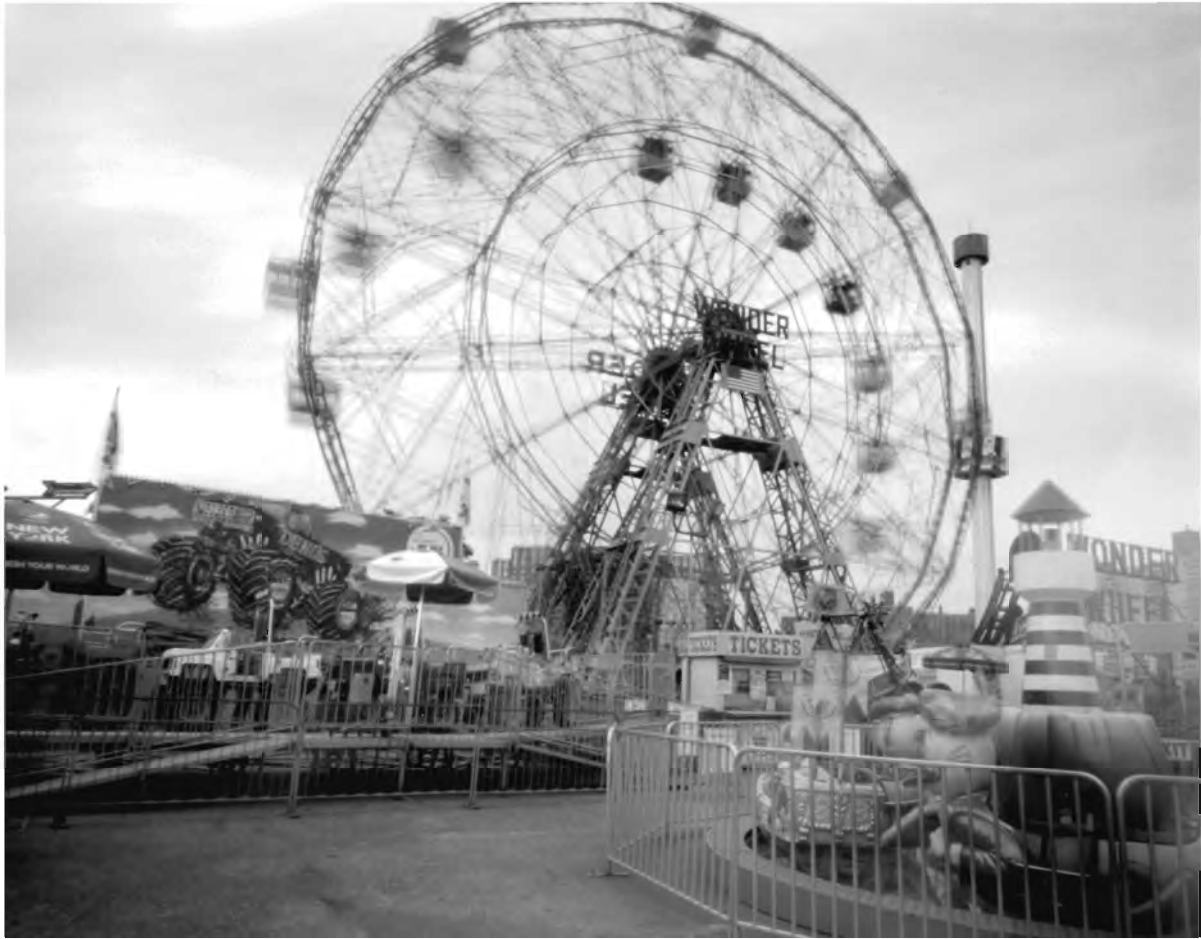
Wonder Wheel (1920)