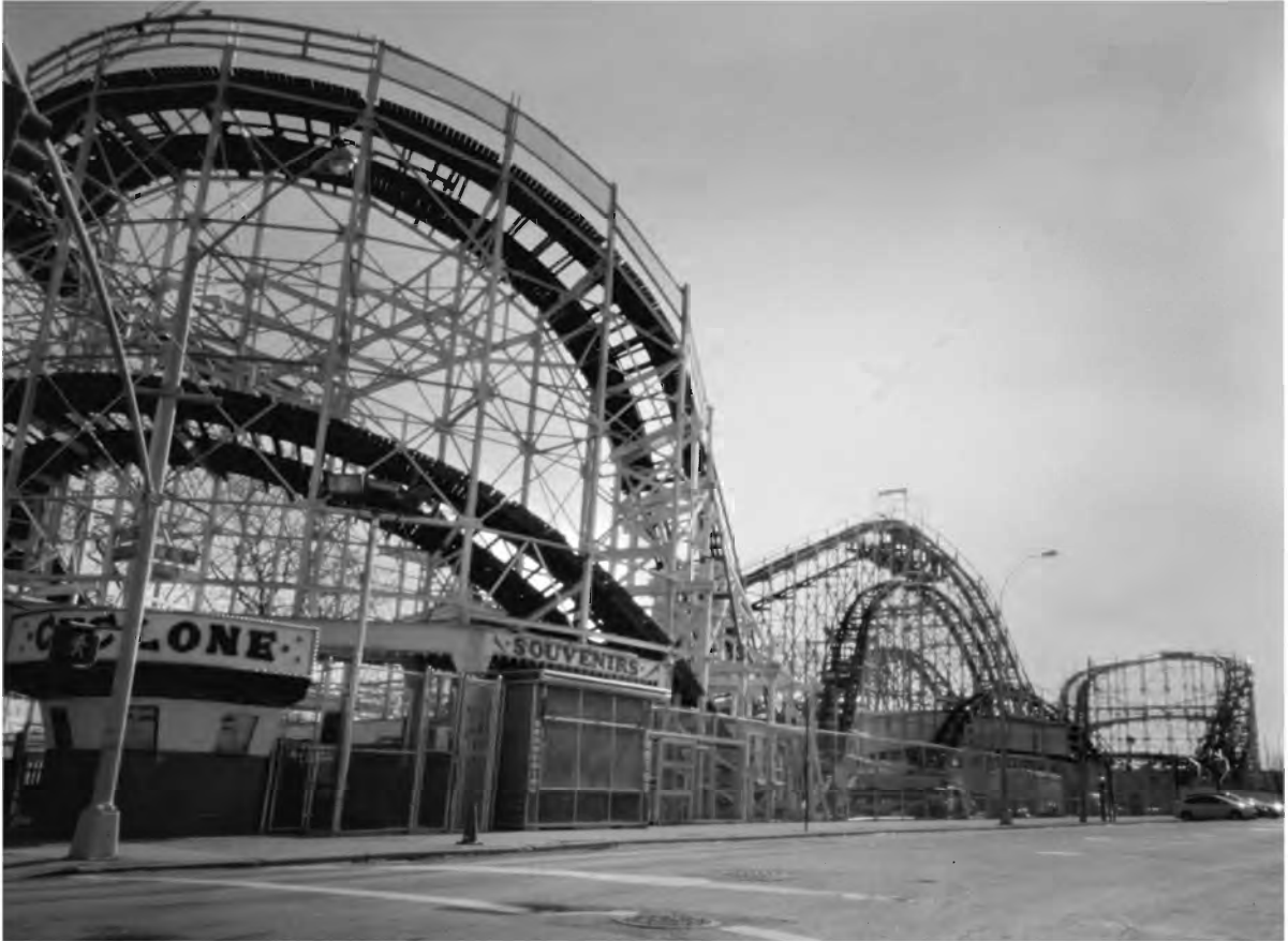
The Cyclone. A 'Golden Age' wooden roller coaster