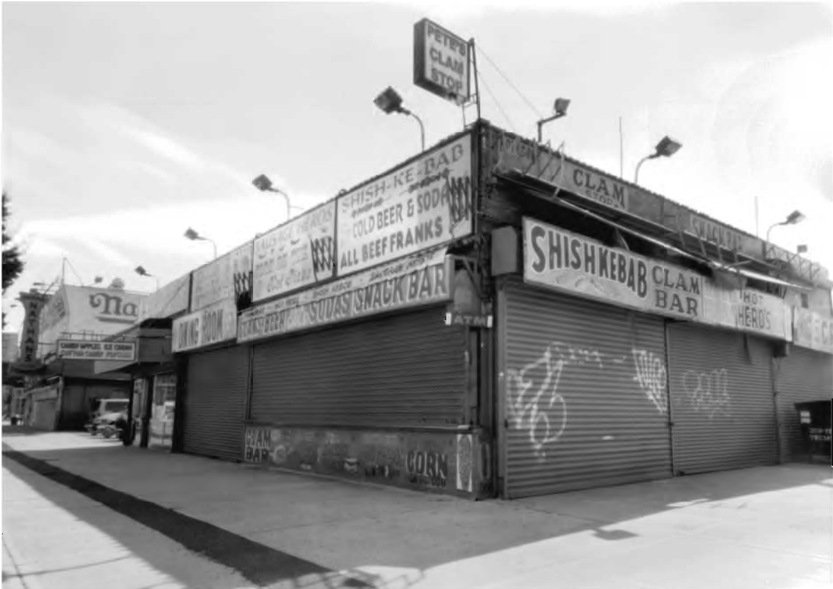
Pete's Clam Stop the Winter after Hurricane Sandy