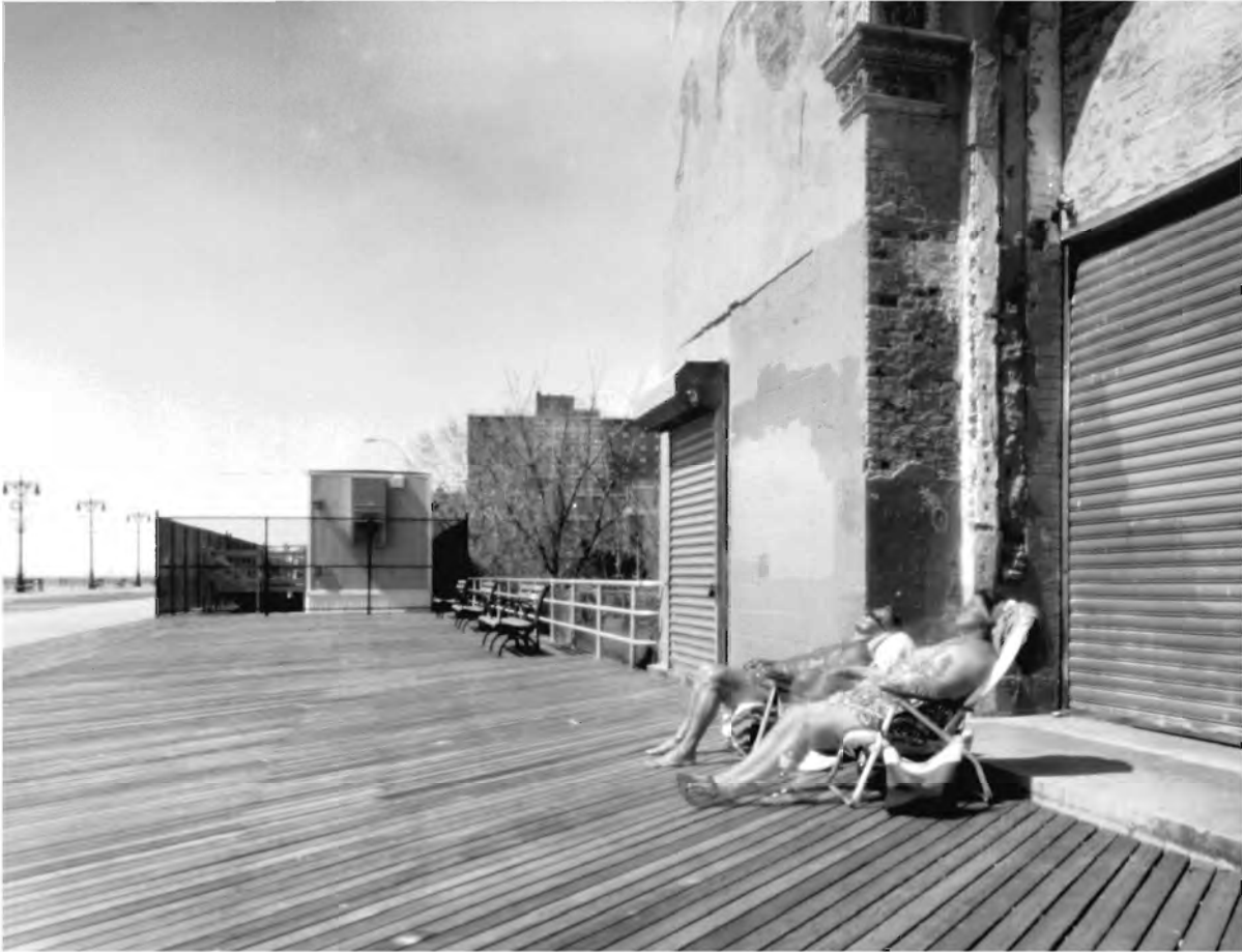
Winter sunning in front of Child's Boardwalk Restaurant