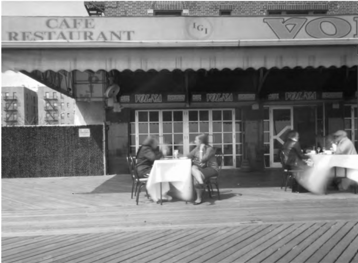
Volna Restaurant on the Brighton Beach Boardwalk