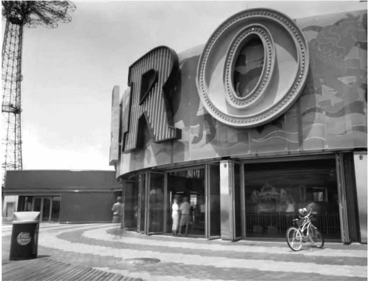
B & B Carousell (1919) built in Coney Island. Restored 2013