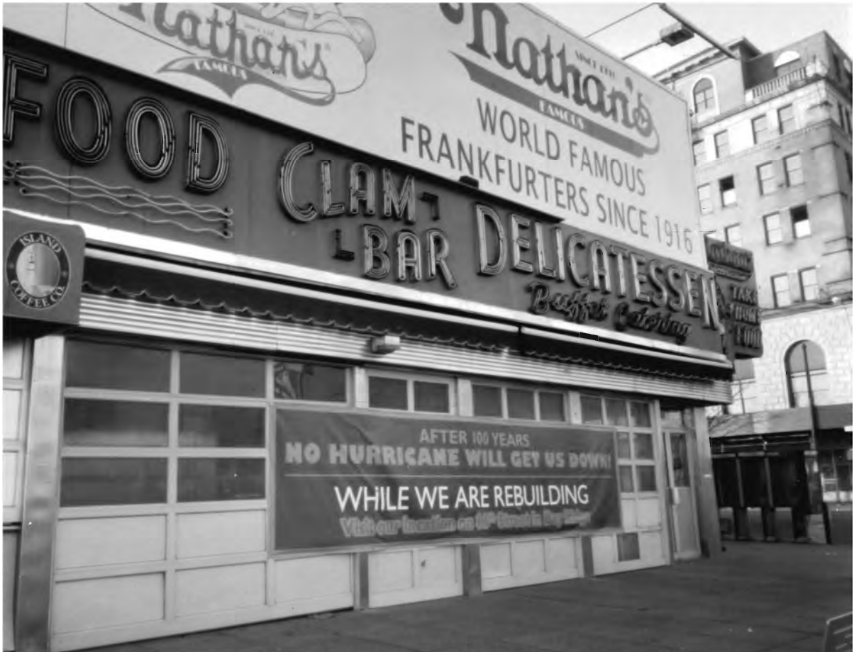
Nathan's Famous original location was flooded and destroyed by Hurricane Sandy. Restored 2013.