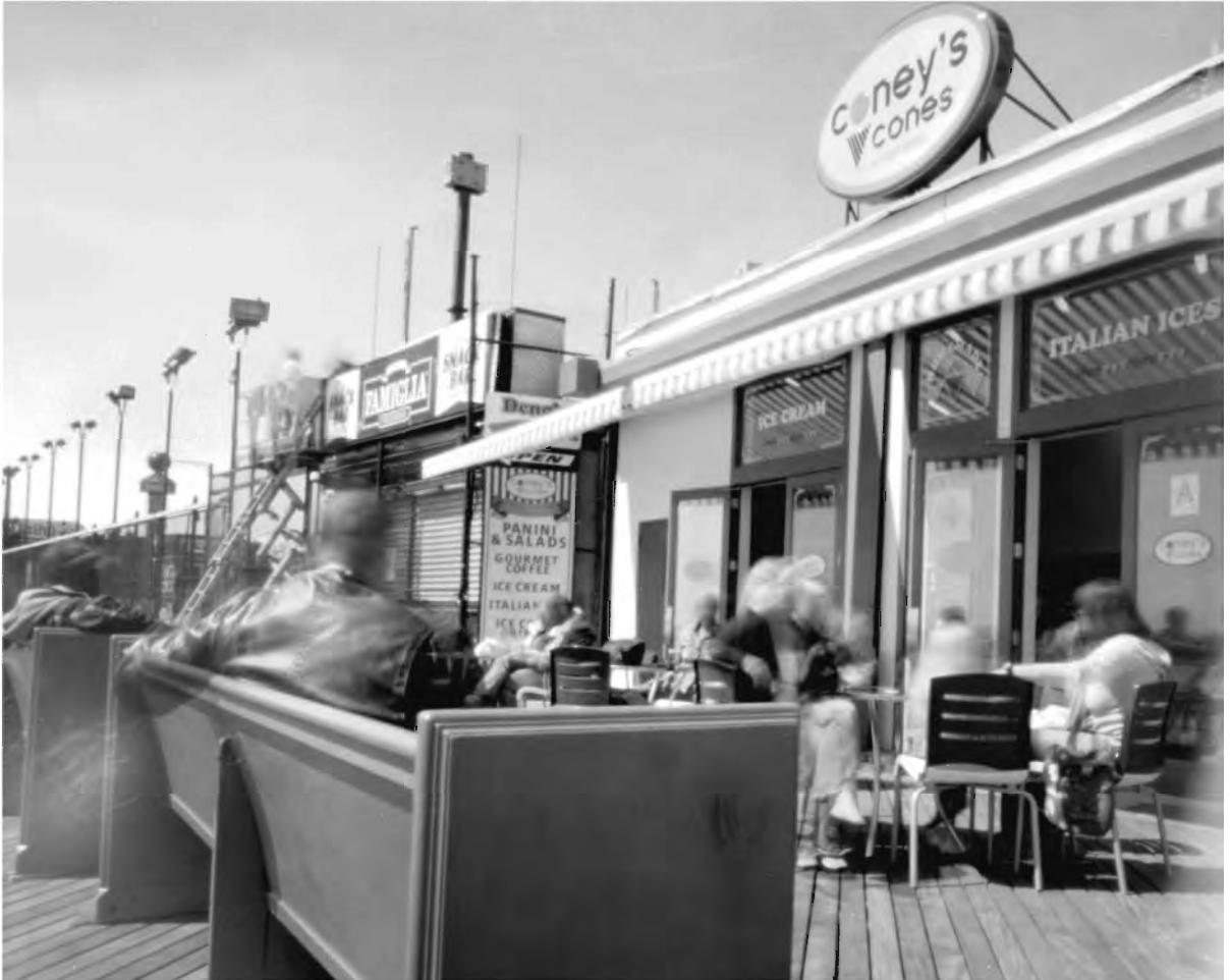
Coney's Cones on the Boardwalk