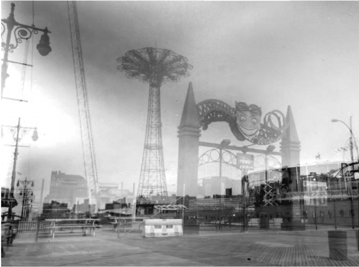
Parachute Jump and Luna Park entrance as seen from the Boardwalk