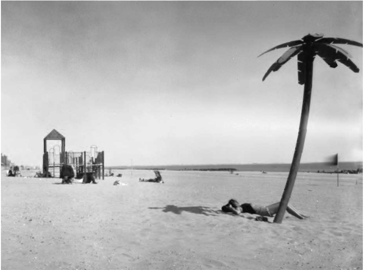
Taking shade under the tree.