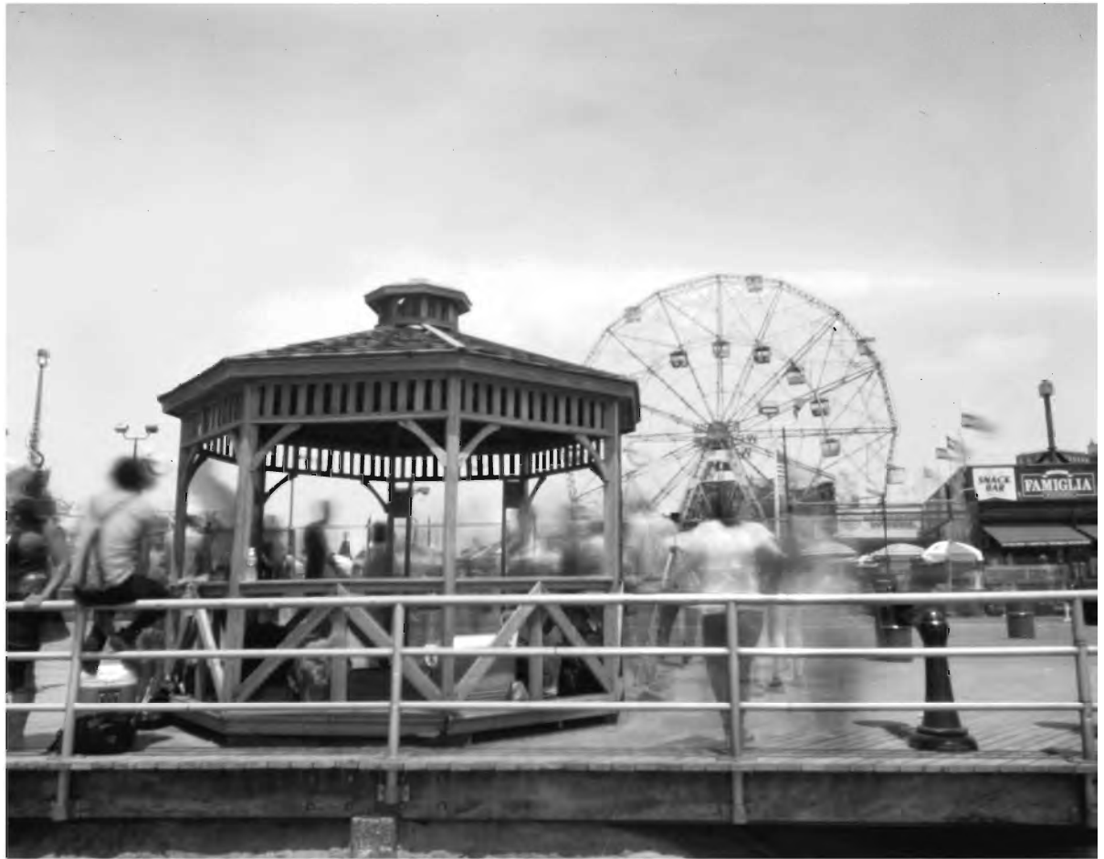
Boardwalk Gazebo and the Wonder Wheel