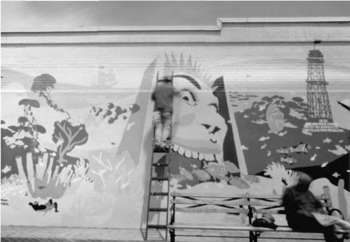
The Restoration (2012)