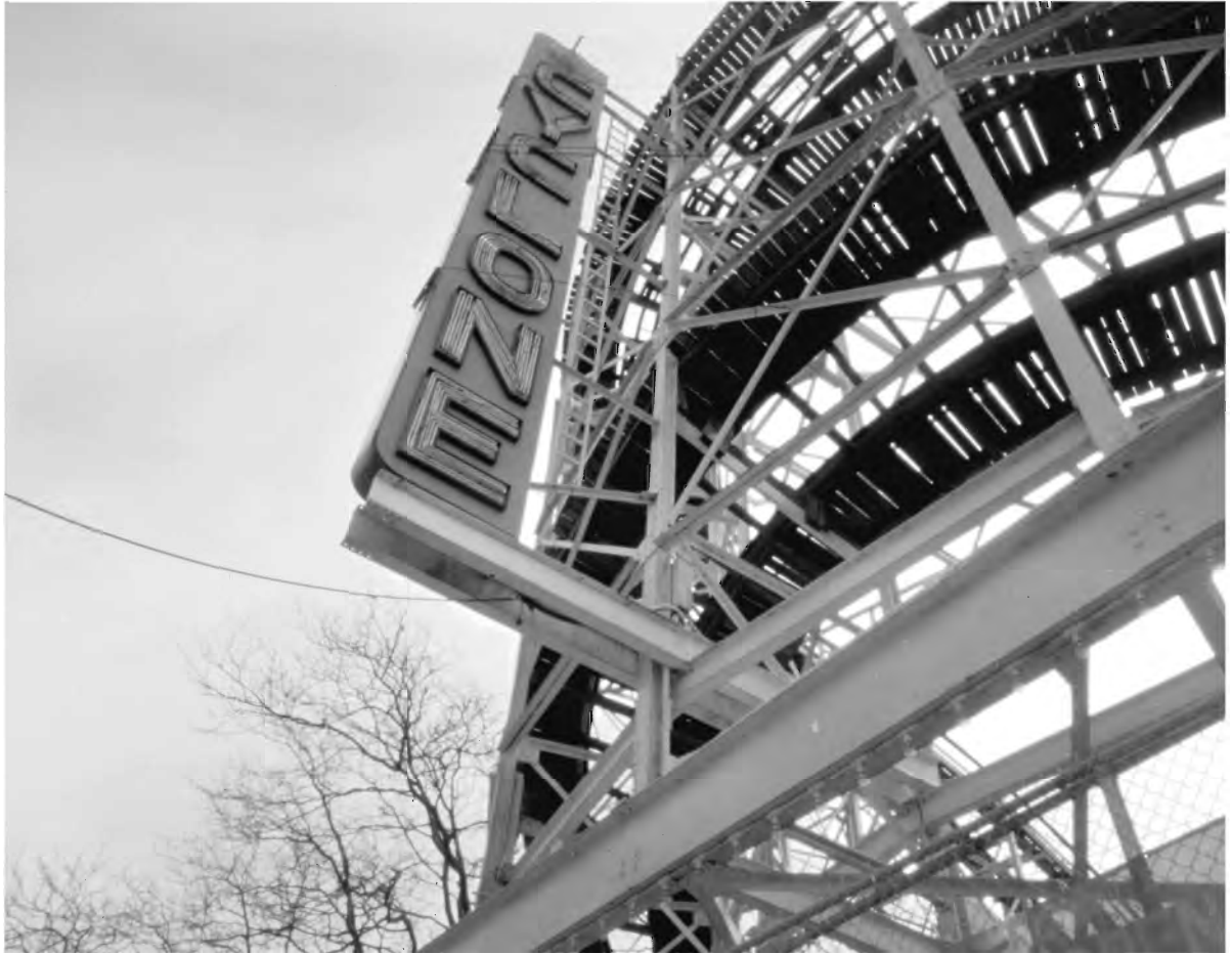
The Cyclone (1927)