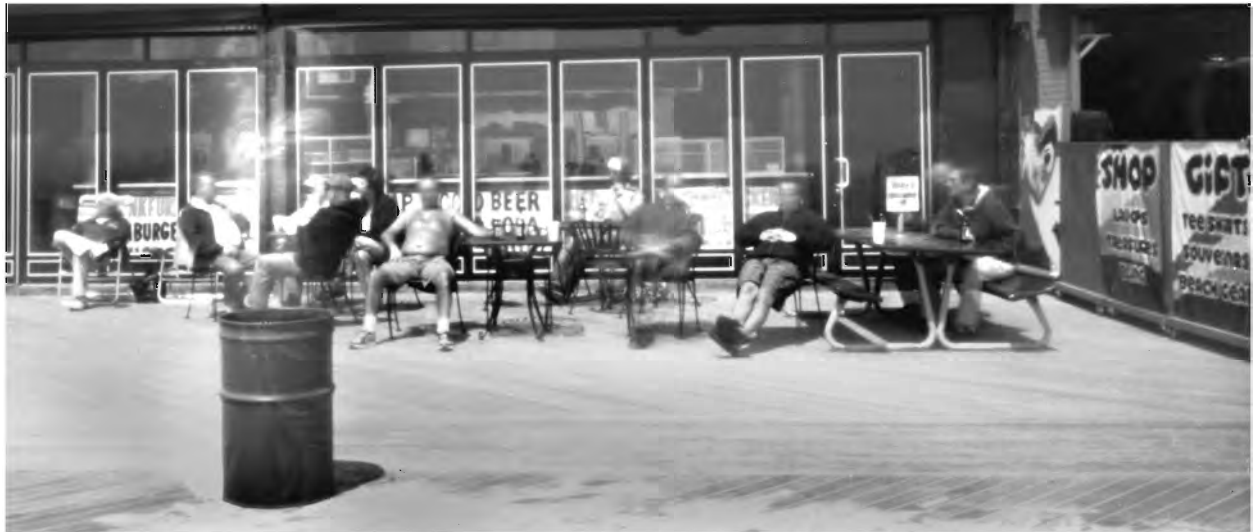
Spring sunning in front of Ruby's on the Boardwalk