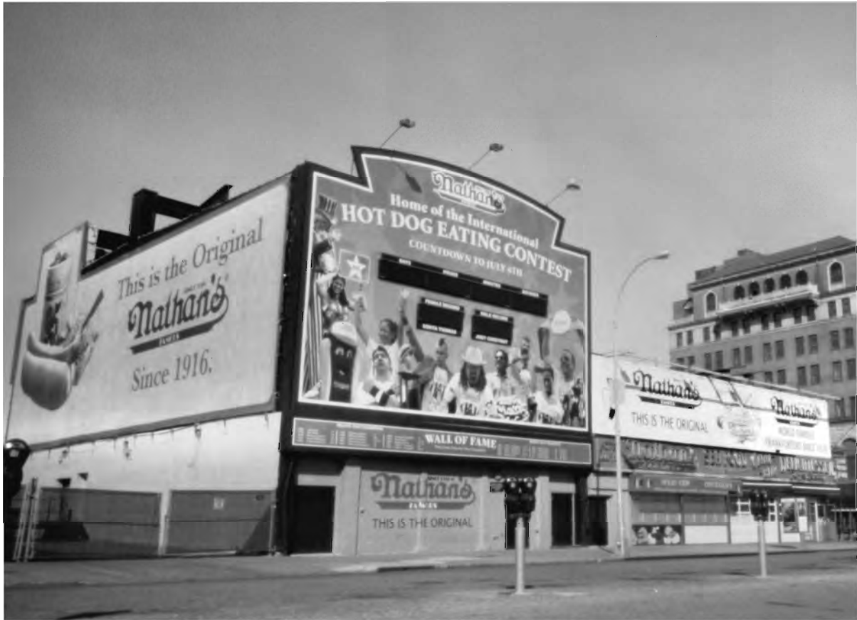
Nathan's Famous "Home of the International Hot Dog Eating Contest"