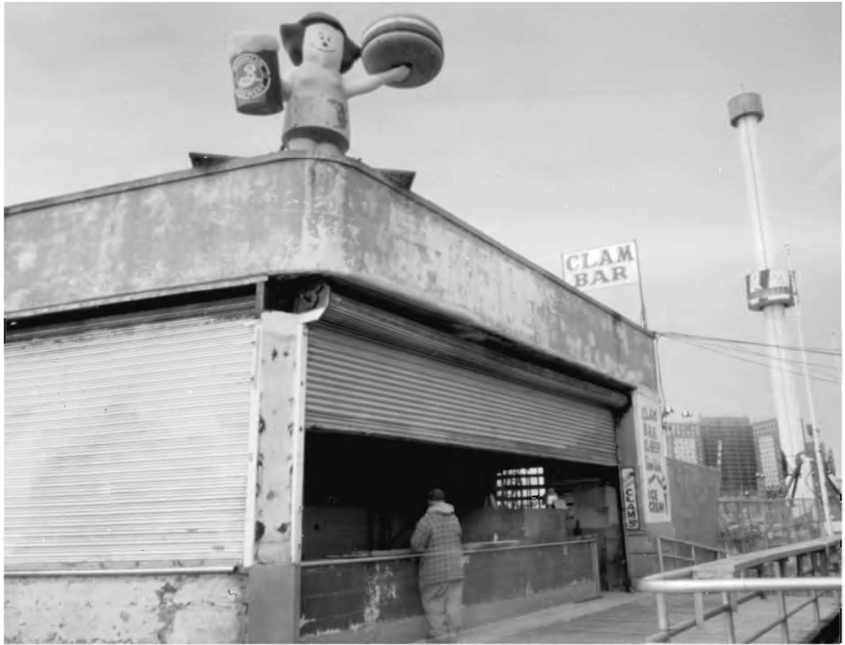
Paul's Clam Bar. Restored as Paul's Daughter (2012). Roof Character lost during Hurricane Sandy. Astrotower removed 2013