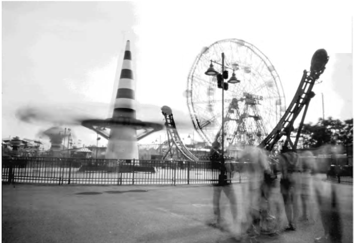
The Wonder Wheel as seen from Luna Park