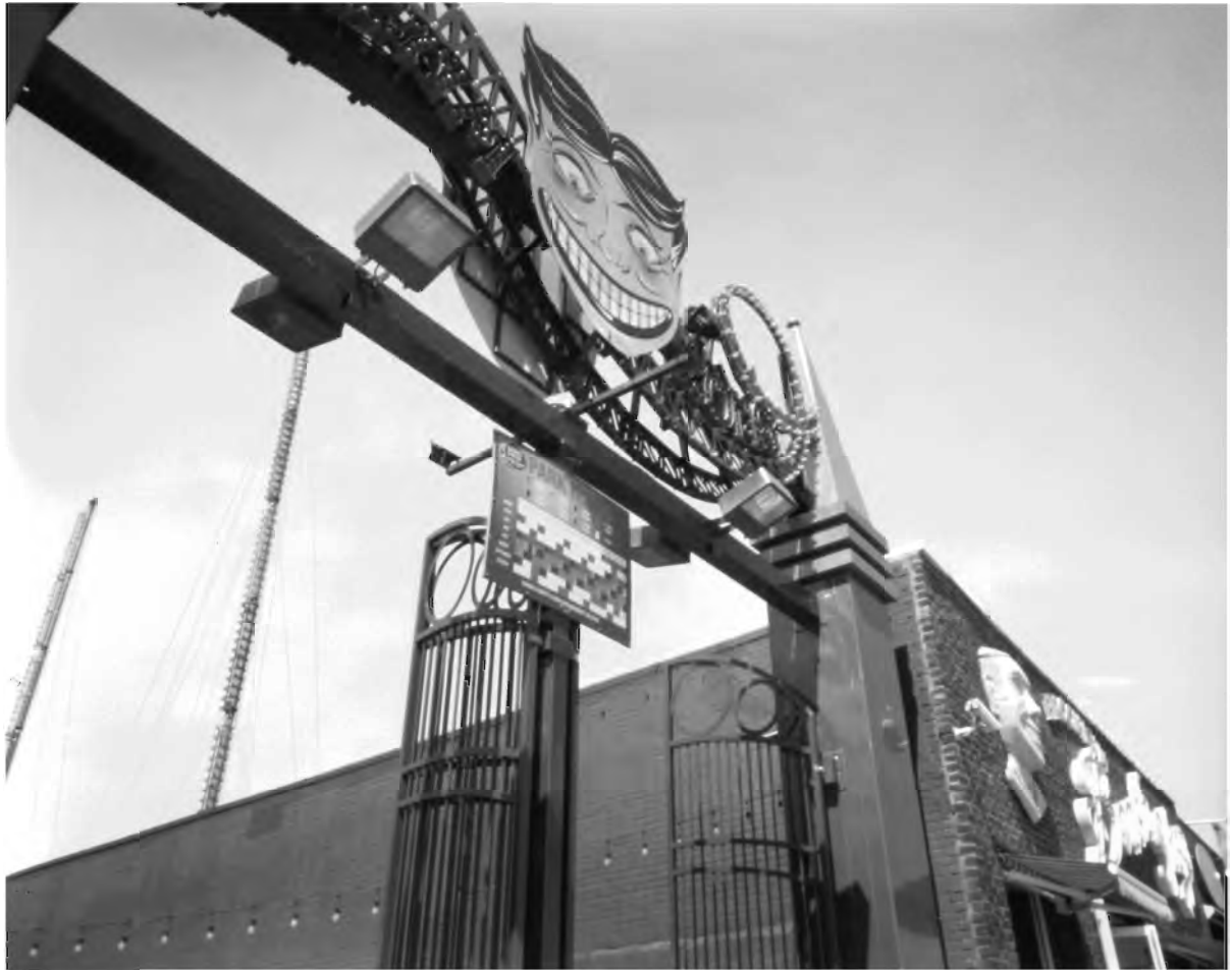
Luna Park entrance from the Boardwalk