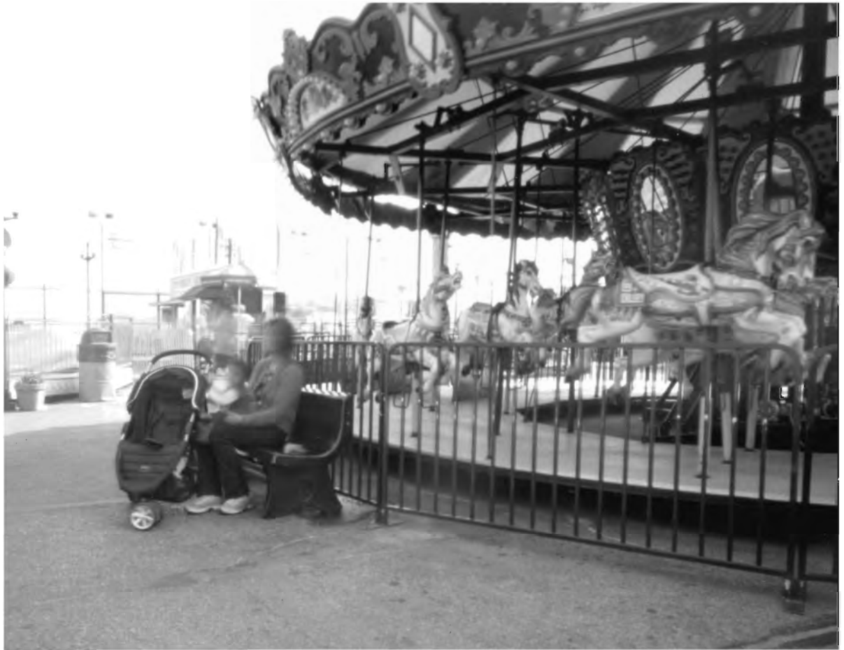
Carousel at Deno's Amusement Park