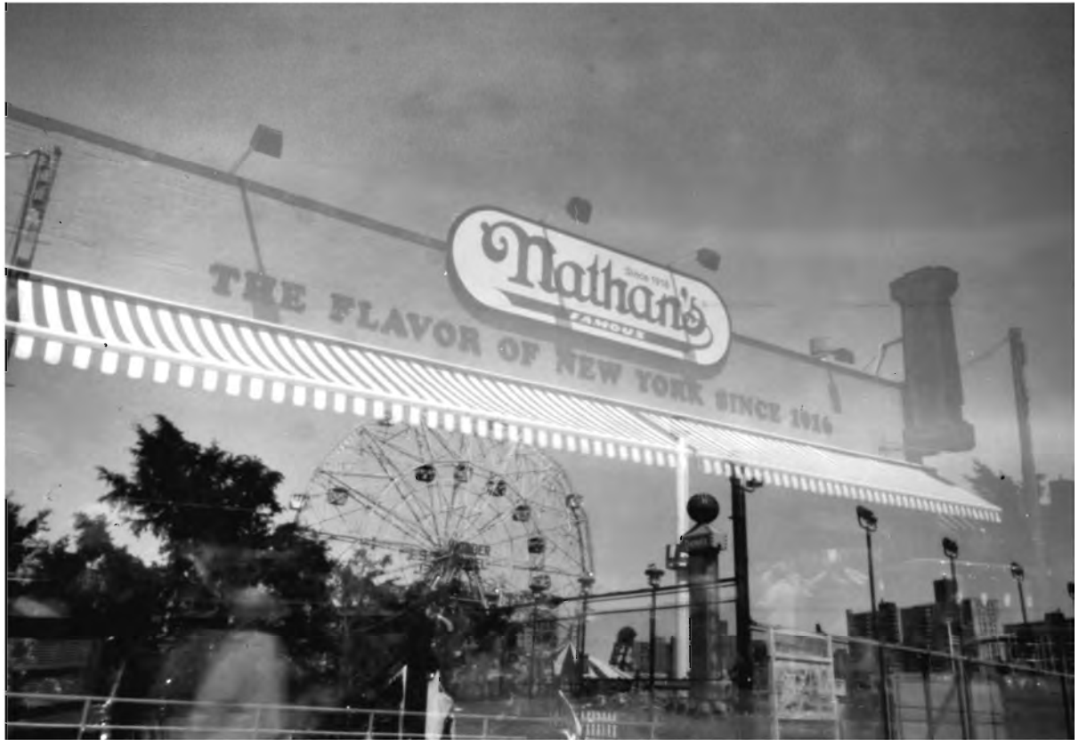
Nathan's Famous and Wonder Wheel as seen from the Boardwalk