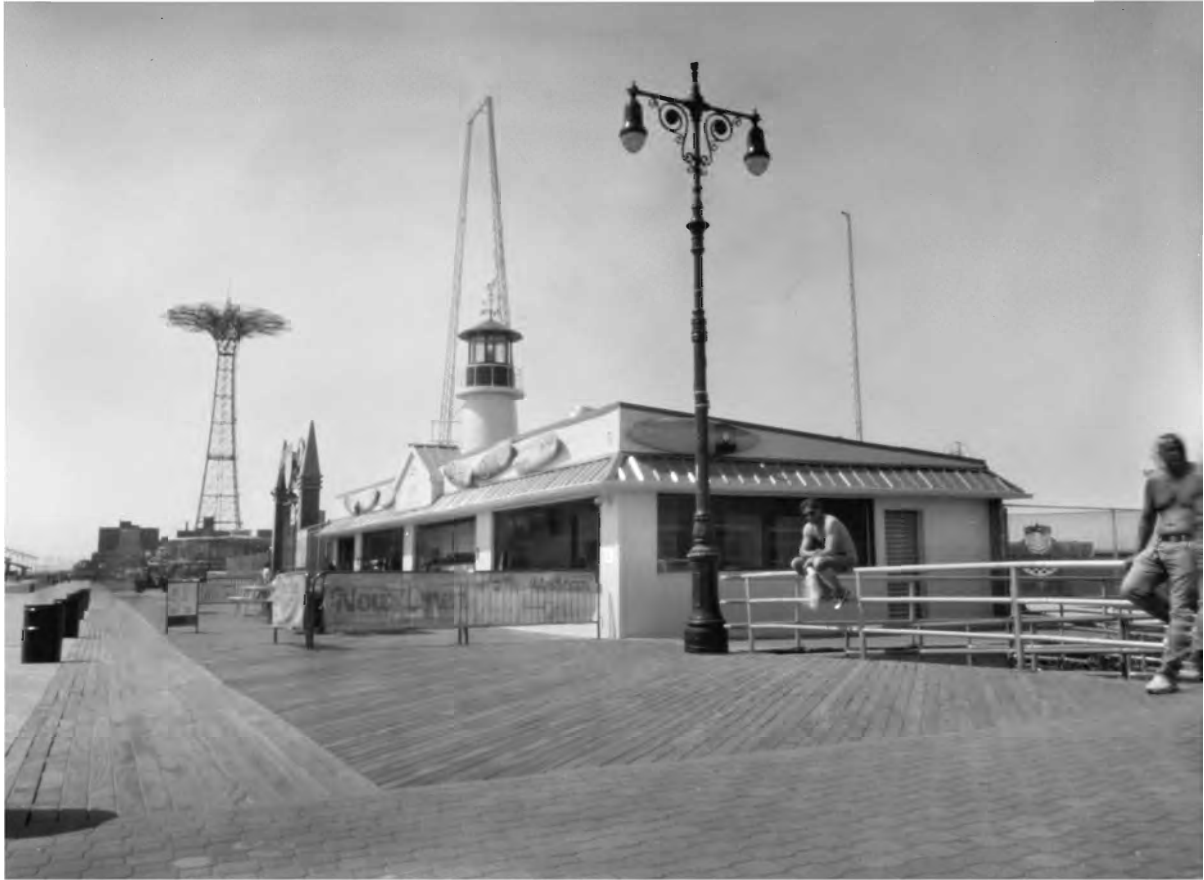
The Parachute Jump and PTB Bar