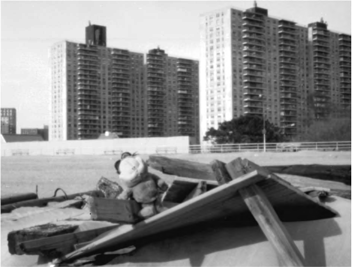
Washed up on the Beach by Hurricane Sandy