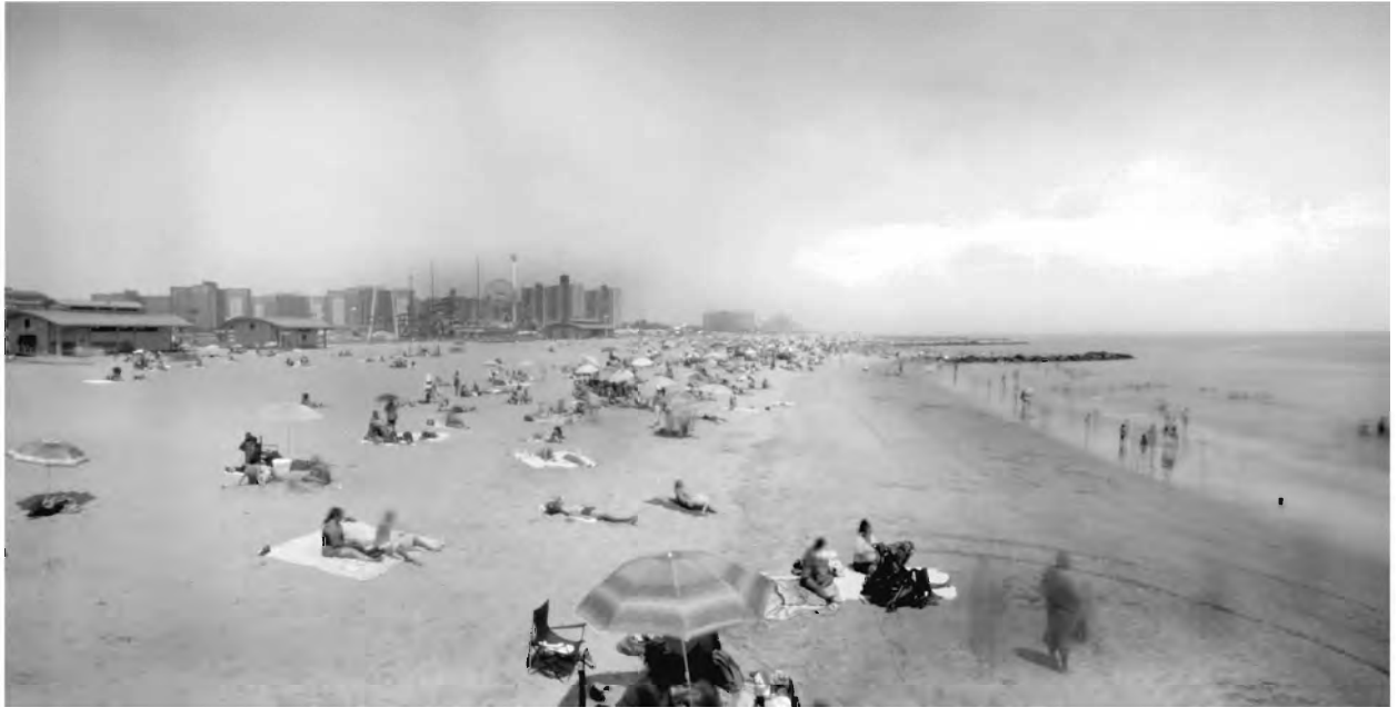
The Beach as seen from the Pier