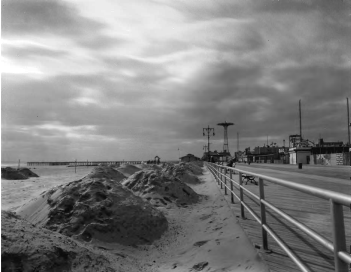
Beach restoration after Hurricane Sandy