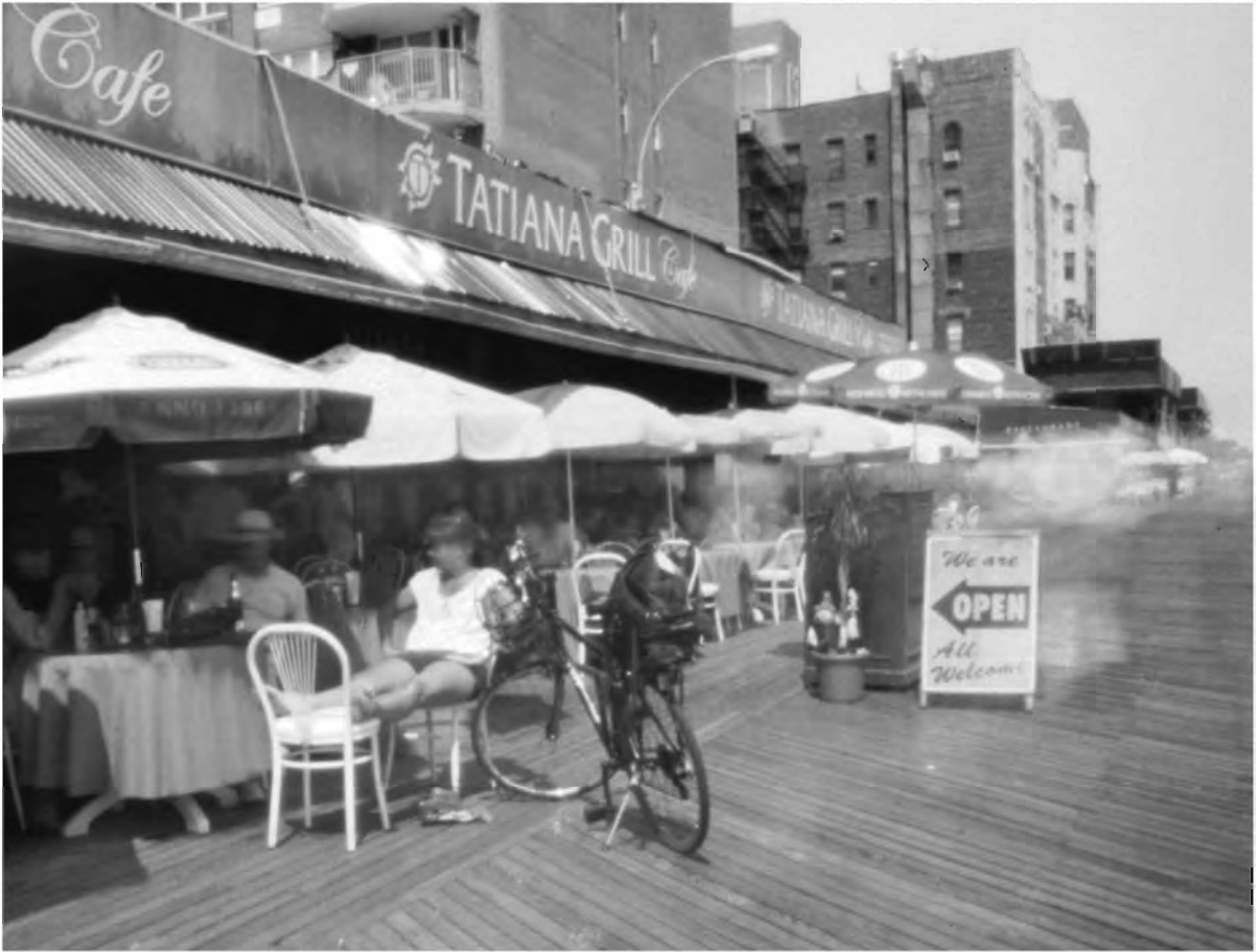
Tatiana Restaurant on the Brighton Beach Boardwalk