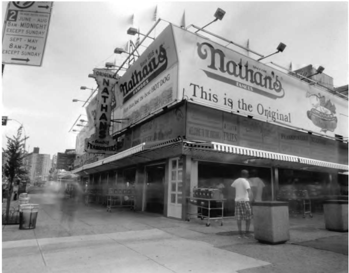
"This is the Original Nathan's. World Famous Frankfurters Since 1916"