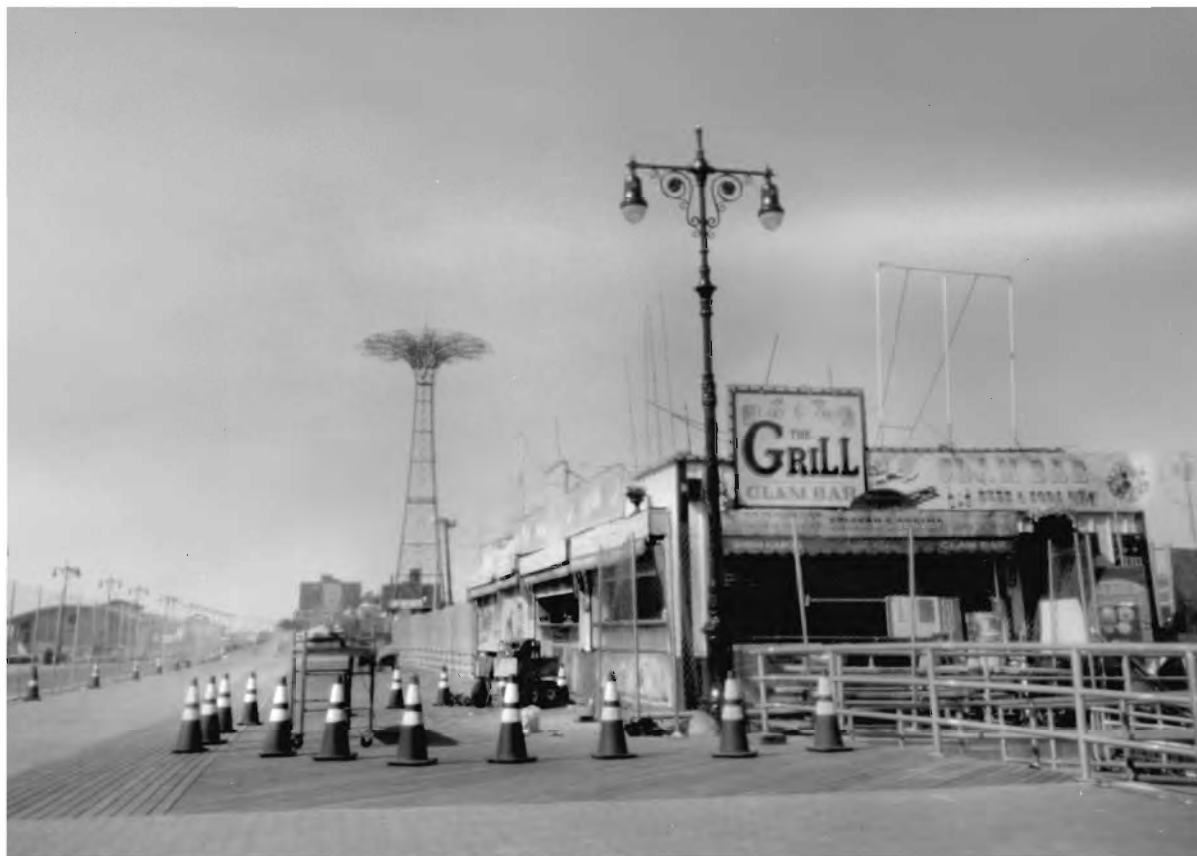
Grill House on the Boardwalk. Removed 2012