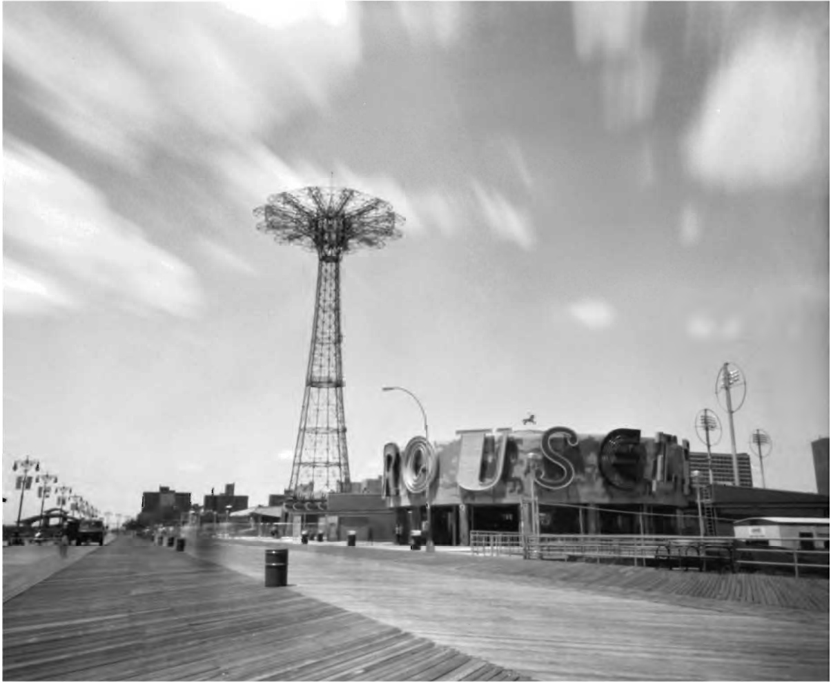
The Parachute Jump and B & B Carousell from the Boardwalk