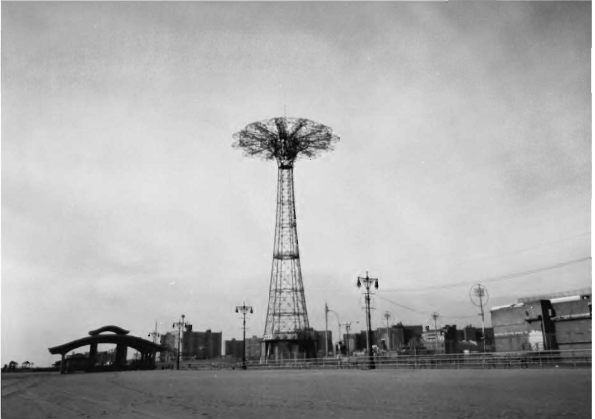
Parachute Jump (1939)