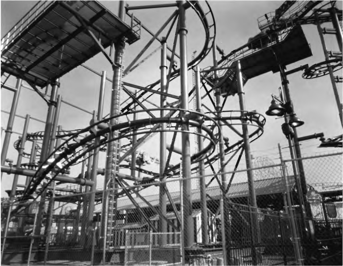
Soar'n Eagle at Luna Park