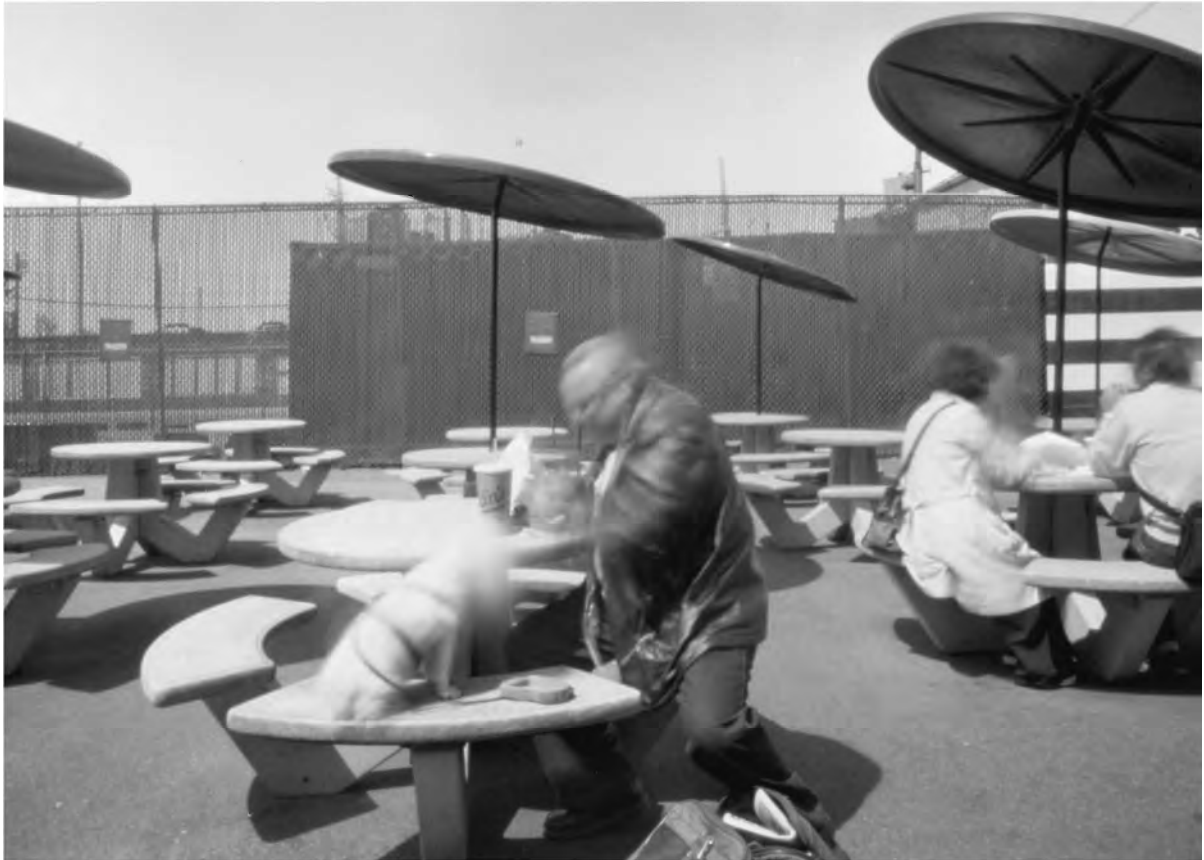
Doggie having a doggie at Nathan's Famous