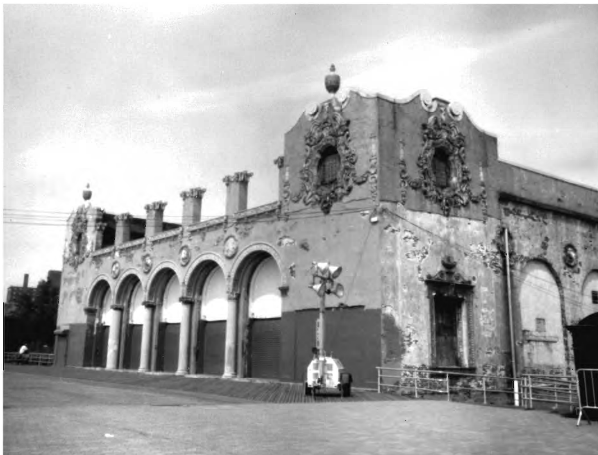
Child's Boardwalk Restaurant (1923)