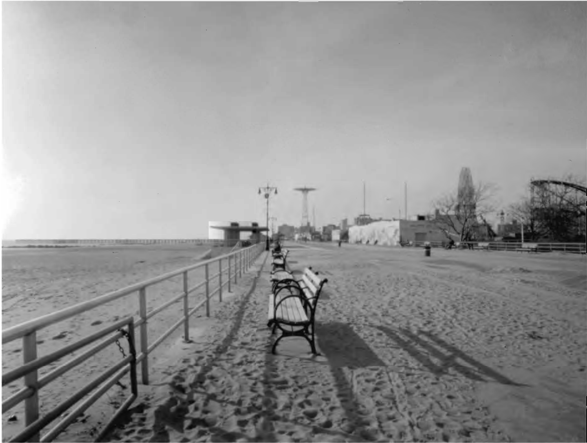
Sand deposited on the Boardwalk by Hurricane Sandy