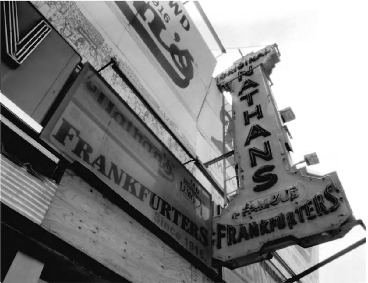
Nathan's Famous during restoration after Hurricane Sandy