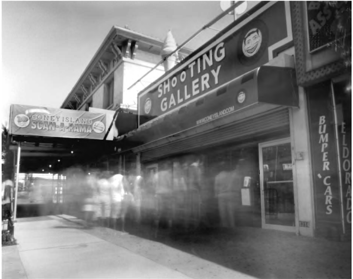
The Shooting Gallery was found behind another game booth after Hurricane Sandy