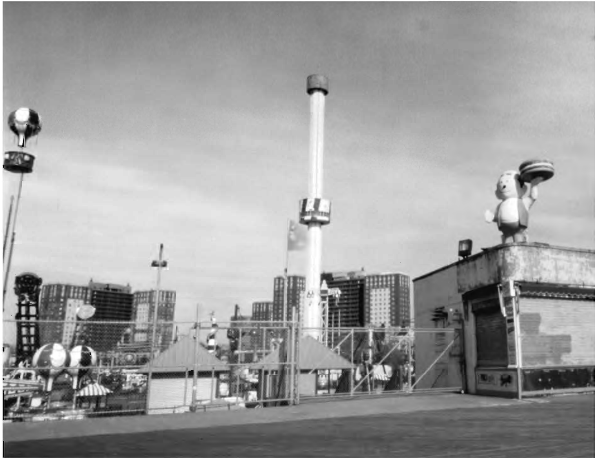
Astrotower. Removed 2013