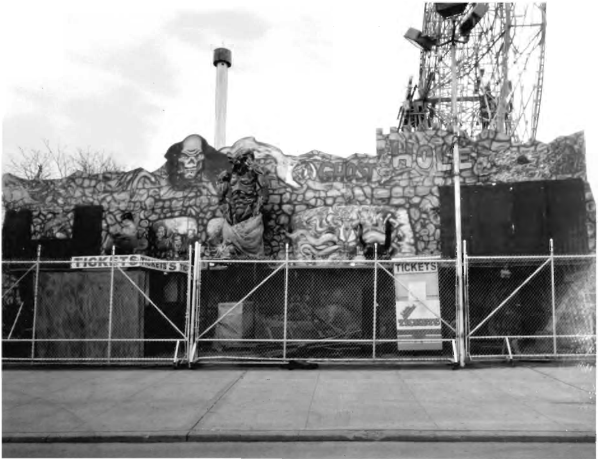
The Ghost Hole