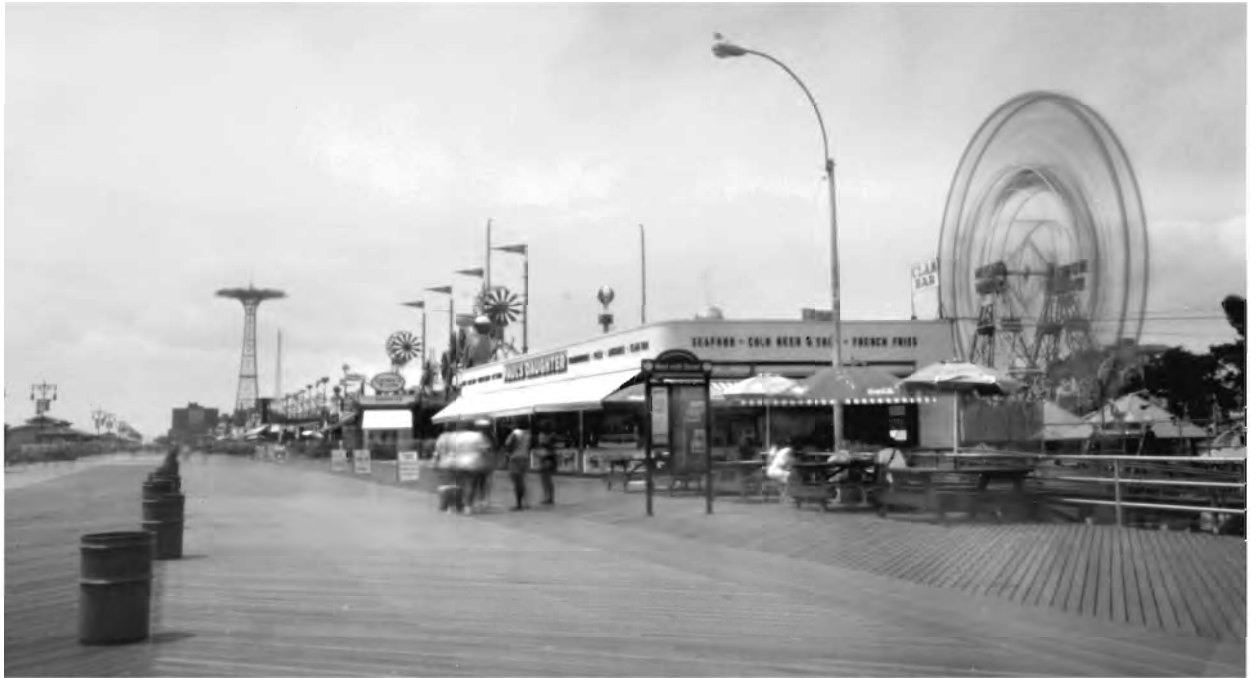
The Parachute Jump, Coney's Cones, Paul's Daughter and Wonder Wheel from the Boardwalk