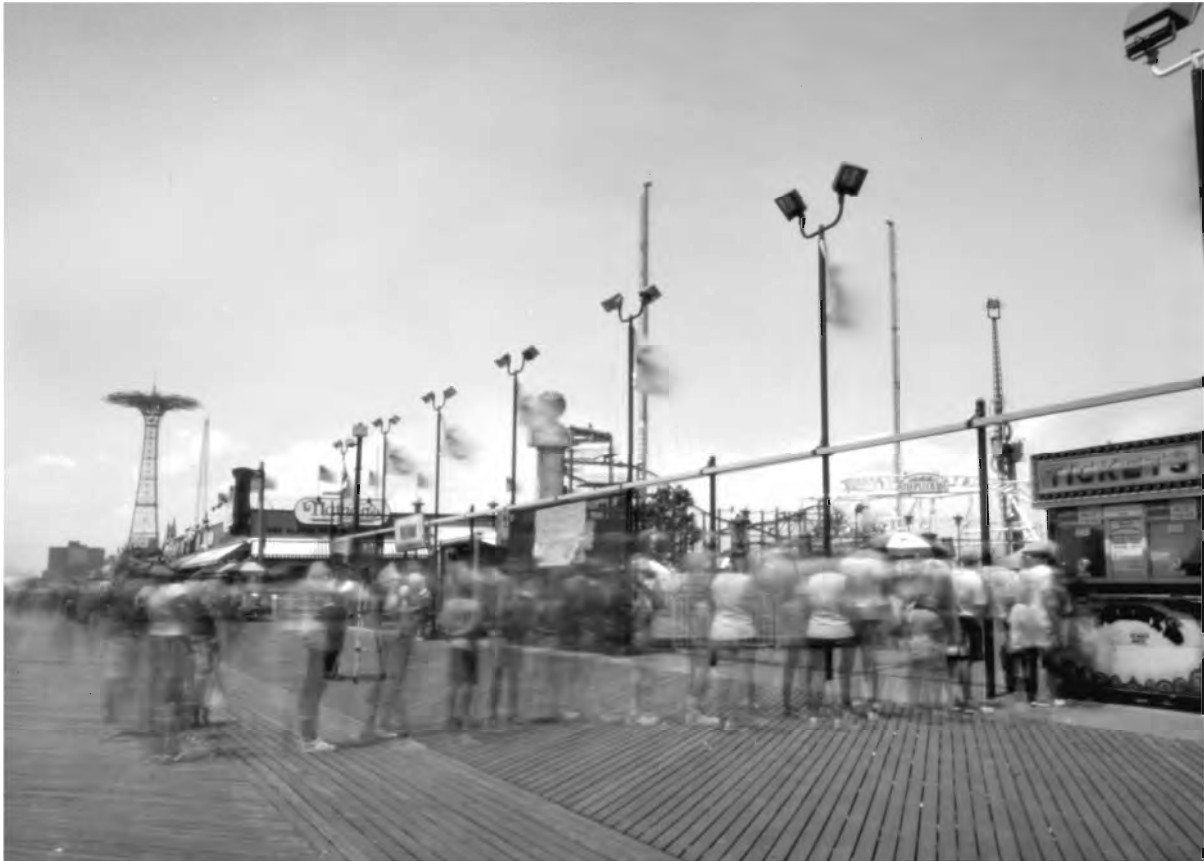
Waiting for tickets for Dino's Wonder Wheel and Amusement Park