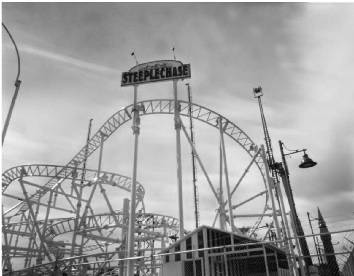
Steeplechase at Luna Park